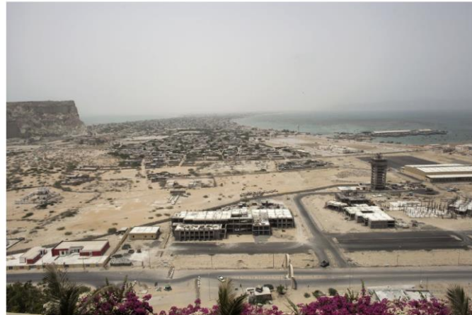
Gwadar, a port on Pakistan's Arabian Sea coast, is part of the China-Pakistan Economic Corridor.