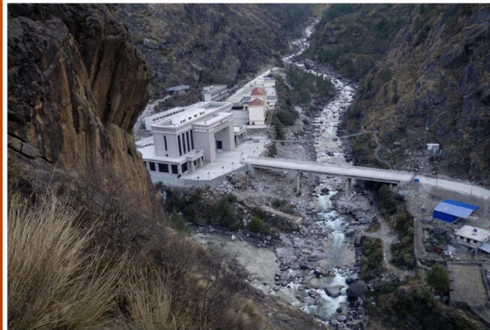
Figure 2. Aerial view of infrastructure at China–Nepal border above Rasuwaghadhi.

Nepal; China; Himalayas; hydropower; infrastructure; development