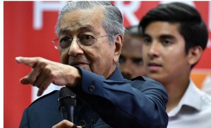
MALAYSIAN Prime Minister Mahathir Mohamad

KUALA LUMPUR: Malaysia is haggling over the terms of a $14 billion rail deal with its Chinese partners and can reduce its ballooning national debts by $50bn by doing away with mega projects,